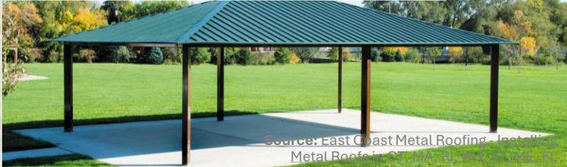
Metal Shade Structure