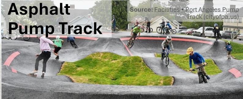
Asphalt Pump Track