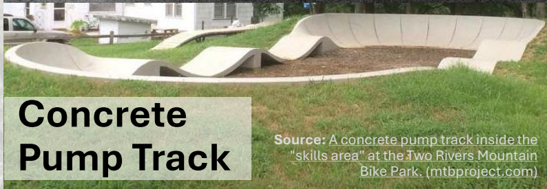
Concrete Pump Track