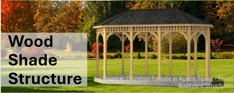
Wood Shade Structure